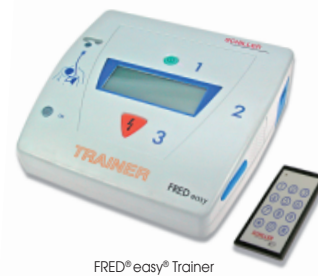
FRED® easy® Trainer