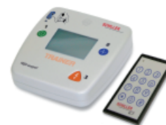
FRED® easyport® Trainer