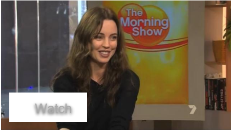
0:00 / 2:41